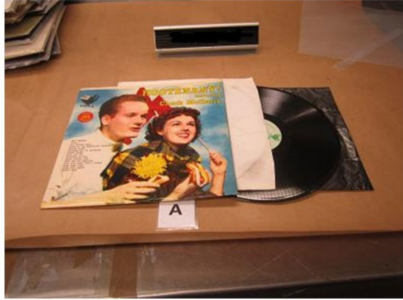
Images: 4kg of synthetic drugs concealed in the packaging of vinyl records en route from Europe to Central America