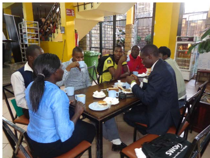
Speakers and other guests sharing light moments and a cup of tea