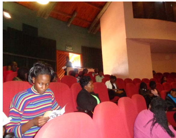
Participants listening keenly on the presentations